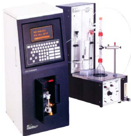
Figure 1: CM140 Total Inorganic Carbon (TIC) Analyzer