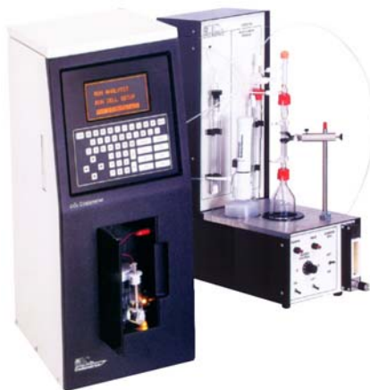
Figure 1: Model CM140 TIC Analyzer